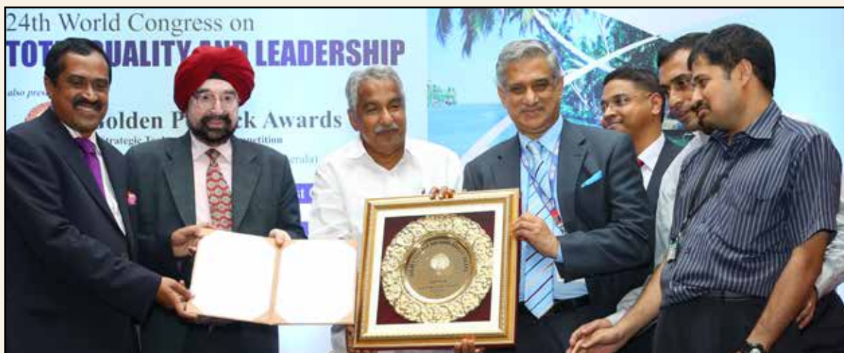
Golden Peacock Award for Quality (2013)